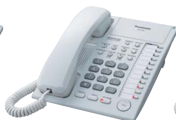
■ KX-T7720 Speakerphone Unit