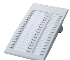
■ KX-T7740 DSS Console